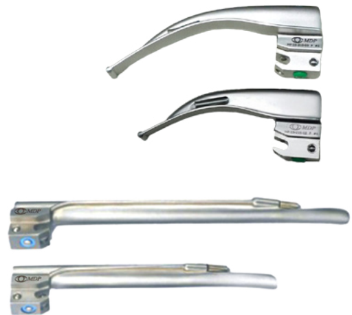
Blades are sandblasted with smooth edges. Bulbs are easy to change.

MDP offers every possible selection of German quality Macintosh, Miller, Phillips, and Wisconsin blades.