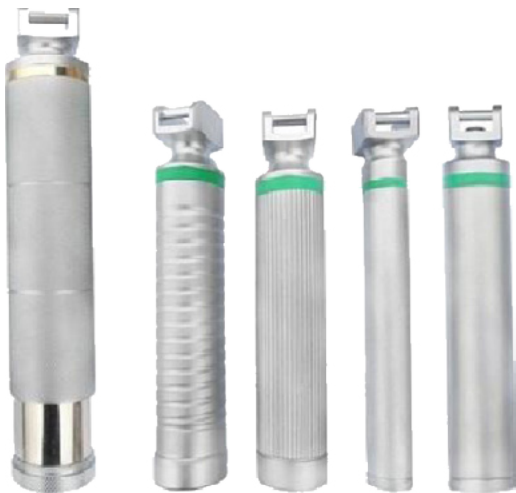
Designed for ease-of-use to improve patient care, safety, and staff satisfaction

MDP offers German quality stainless steel handles with Halogen, Xenon, or LED lighting in conventional and fiber optic styles as well as an assortment of sizes for adult, pediatric/penlight, and stubby handles.